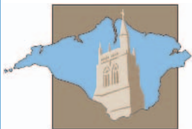
The Church at the Heart of the Island